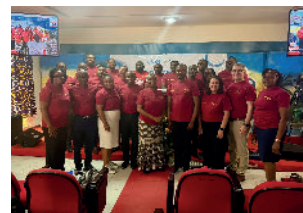
Photo of WAD Health Advisory Participants

Lome, Togo | West Central Africa Division (WAD)