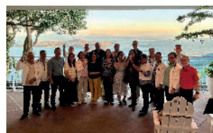
Participants at the Southern Asia Pacific Division Health Ministries Advisory

Cavites, Philippines | Southern Asia Pacific Division (SSD)