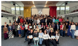
Participants at the Addiction Recovery Facilitator training in Romania

Brasov, Romania | Inter-European Division (EUD)