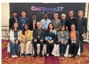
Participants of the Northern Asia Pacific Division Health Ministries Advisory

Bangkok, Thailand | Northern Asia Pacific Division (NSD)