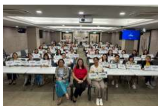
Photo of participants from Malaysia Union Mission