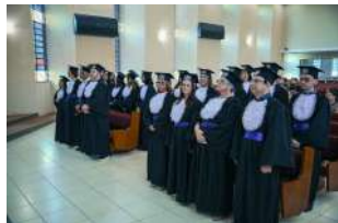
Graduates of the Journey to Wholeness in Parana, Brazil

Nurses have historically played a significant role in the church's mission, often providing care to the most vulnerable individuals worldwide. In the South American and North American Divisions of the Adventist Church, nurses have established the Adventist Nurses Association to inspire and provide opportunities for mission in their territories and beyond. These Adventist nursing associations organized a division-wide congress for nurses, bringing together hundreds of nurses. The NAD Nursing Convention took place at the NAD's headquarters in Columbia, Maryland, from April 3 to 6, 2025. The SAD Nursing Congress was held at the São Paulo Adventist University Campus 2 in Brazil from May 2 to 4, 2025. Both conventions highlighted the personal testimonies and life stories of missionary nurses, both active and retired, who are committed to serving in difficult places, reaching unreached people groups from the Middle East to the continent of Africa, bringing healing and wholeness. Inspired by the biblically grounded and mission-focused presentations, participants left inspired to become more engaged in the health and healing ministry of their local congregations and to participate in mission trips in needy areas.