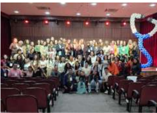
Participants from the Nursing Convention in São Paulo, Brazil.