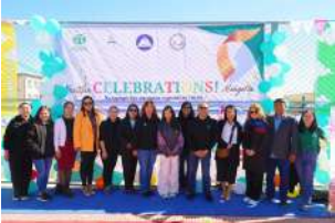
Participants at the Celebrations program in Mongolia in May 2025.