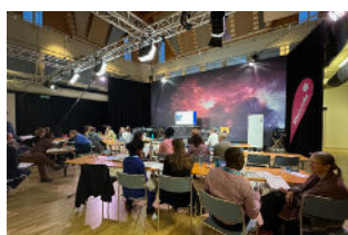
Attendees at the Swedish Union Lifestyle Coaching Skills workshop at Hagegården, Sweden.