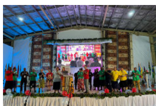
SPD leaders together at the launch of the AI Assistant Hope, in Fiji.