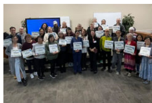
Participants of the Lifestyle Coaching Skills training at Weimar Institute in California, USA.