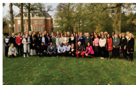
Attendees in the ARMin training at the Dutch Union training.