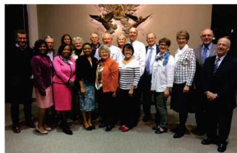
Participants of the GCNC meeting gathered at the GC Atrium on October 19, 2017.