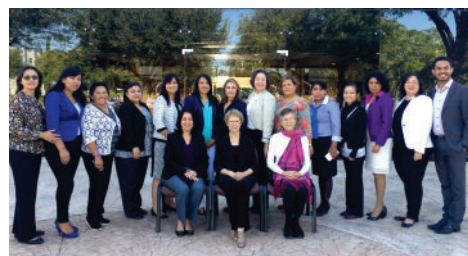
AINEC-LA participants representing Adventist nursing programs in Latin America.