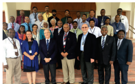
Attendees at the SUD HM Advisory in Hosur, India.