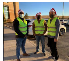
Some of the volunteers who make the Christmas Store possible

Health Promotion has been a central focus for the Adventist church historically and several Adventist universities around the world offer graduate level studies in the field. Several Adventist Universities in South America came together to form the Adventist Network for Health Promotion (REDALPS) with the goal of gathering Adventist experts in the field and integrating health promotion in the mission framework of the church. REDALPS organized the first international Congress on Health Promotion in the context of the pandemic and to plan next steps for expanding the role of REDALPS in South America. The event was held virtually with the presence of representatives from Adventist Universities in Argentina, Chile, Peru and Brazil. Following the event an e-book is being produced with the content of the presentations.