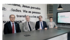
Presenters during the AMA Online Congress

António Guterres, the United Nations' (UN) Secretary-General, stated that the mental health of society has been severely impacted by the COVID-19 pandemic crisis and is a priority to be addressed urgently. He added that Mental health will remain a core concern even after the pandemic is over. In the US, the Centers for Disease Control (CDC) stated that 41% study participants reported at least one adverse mental or behavioral health condition during the pandemic. "The increase in depression, anxiety, stress and trauma-related disorders, substance abuse and suicidal ideations is staggering" especially among 18-24 year-olds, with three in four reporting at least one adverse mental or behavioral health condition, and one in four reporting seriously having considered suicide in the past 30 days. In response to this great need, the General Conference launched a Mental Health initiative during the church's Annual Council on October 8, 2021. The goal is to raise awareness, provide resources and call people to action to help reverse these statistics. Education, Family, Youth and Health Ministries came together with the goal of promoting the initiative and motivating people to become involved. More information is available in page 2 of this newsletter under resources.