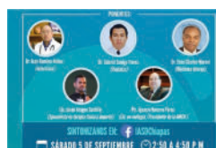
Panelists in the Chiapas Symposium