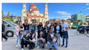
Youth Participants Engage in the Health Challenge Project.