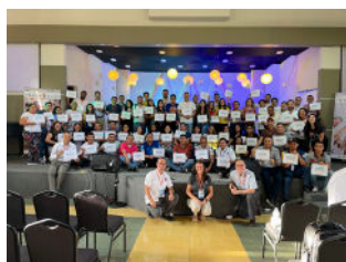
Attendees at the Youth Alive in Colombia.