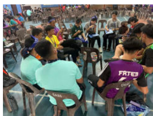
Attendees at the Youth Alive in Malaysia explore a learning activity in their friendship group.