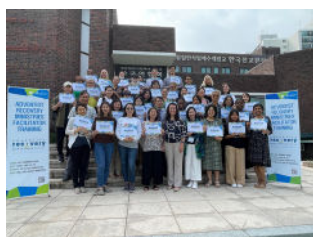
Participants of the Adventist Recovery Ministries Training in Seoul, Korea.