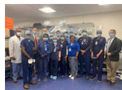
White Oak Medical Center staff