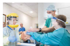
Staff from hospital providing training during the pandemic