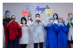
Angelia Clinic staff helps the community in Ukraine.