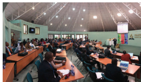
Participants of the AAIM Congress