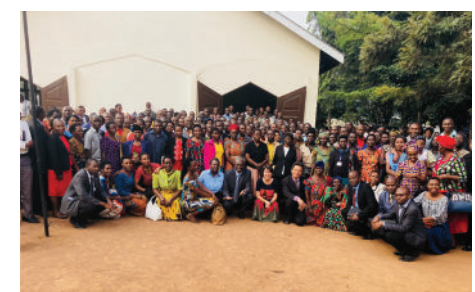
Participants of the Northern Tanzania Union CHM Training.