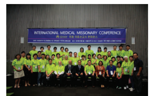
International Mission Congress attendees