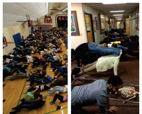
AU students and faculty attempt the Guinness Record on sit-ups | Daily plank time