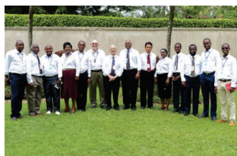
Group of Health Ministries leaders and officers who attended the WAD Advisory