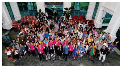
Attendees at the SSD Adventist Recovery Ministries training