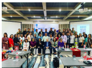
SSD Health Advisory attendees pose for a picture in Bali, Indonesia.