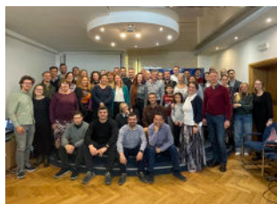
Attendees at the Southern European Union Lifestyle Coaching Skills workshop in Belgrade, Serbia.