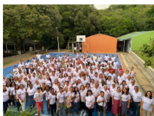
Participants of the Health Congress in North Colombia Union.