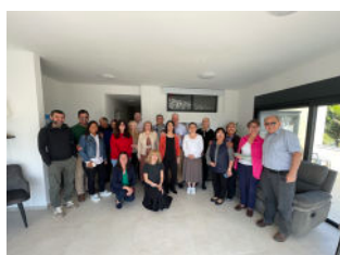
Pastors and their spouses pose with guest presenters and administrators of Israel Field.