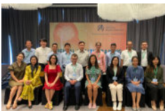
Presenters and Participants of the Mental Health Conference.