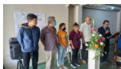
People who were baptized as a result of the Hope Journey health Project in Merida, Venezuela.