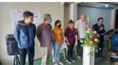
People who were baptized as a result of the Hope Journey health Project in Merida, Venezuela.