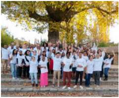
Participants of the youth alive training and conference in South France.