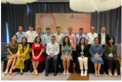
Presenters and Participants of the Mental Health Conference.