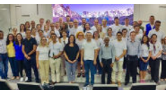
The physicians and organizers who participated in the free health clinic in Bacarena, PA.