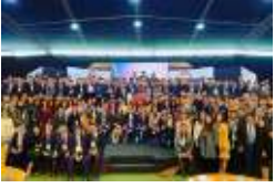
Lifestyle Coaching Workshop Attendees at UPeU who completed the course.