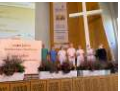
Waldfriede Hospital employees at the centennial celebration