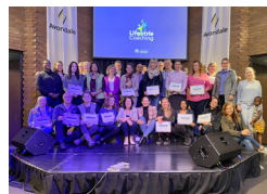
Attendees at the Lifestyle Coaching Skills Workshop held at Avondale.