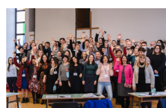
Participants from Slovenia, Albania, and Croatia who completed the training.

Since its first launch in 2019, the Lifestyle Coaching Skills workshop has been made available for hundreds of health professionals, pastors, and lay leaders worldwide. The curriculum is now translated into Spanish, Croatian, and Slovenian. Portuguese, Chinese, Turkish, Farsi, and Arabic are almost completed. After several virtual training sessions during the pandemic, the Chilean Union took the opportunity to host its first presentational training from January 7-9, 2022. Held at the Chilean Adventist University (UnACh) under appropriate covid-19 protocols, nearly 100 participants came together eager to attend the workshop and fellowship in person. They left full of enthusiasm to apply their newly acquired skills in mission. See www.HealthMinistries.com/lifestylecoaching for more information on future courses.