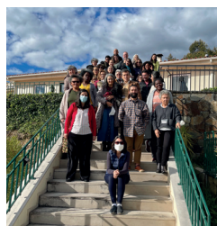
Facilitators pose together during the training.

After a long wait since 2020 due to the pandemic, the Franco-Belgium Union (FBU) decided by faith to bring together dozens of youth leaders, youth pastors, youth, and young adults for its launch of Youth Alive on February 16-20, 2022. Thanks to a collaboration between the FBU and Adventist University Collonges-sous-Salève, the attendees enjoyed great accommodations and facilities in a beautiful atmosphere for a very accessible cost. Youth and adult facilitators were equipped to lead Youth Alive friendship groups and clubs in schools and churches throughout the Union. The training was followed by a youth conference where young people were connected with peers, and mentors as they played, learned and worshipped together in Youth Alive Friendship groups. They also had breakouts and plenary sessions that explored topics such as addictions, suicide, relationships, and emotional healing, among others. On Sabbath, the youth had the opportunity to sign the Youth Alive pledge and serve their community by creating beautiful handmade thank you cards and some sweet treats for health professionals and staff at the La Lignière Adventist clinic in Switzerland for their heroic efforts during the pandemic. "This weekend allowed me to understand the importance of mental health. That it is necessary to listen to God and find strength from Him to break away from bad habits," said a youth attendee. Several committed to being a Youth Alive leader to all, not just in the Adventist community.