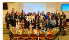
Attendees share the gifts and cards they made for health professionals at La Lignière.