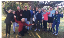
SoZo Health Retreat Participants in NSW, Australia.