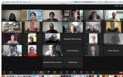
Participants of the ARMin Global training for the Southern Union Mission in ESD

A Lifestyle Coaching Skills (LCS) virtual workshop was launched by the GC Health Ministries department in February 2021. Coaching skills have been recognized as a critically helpful tool in supporting people during lifestyle change. The LCS workshop was first launched in 2019 during the Global Conference of Health and Lifestyle with increased interest for it around the world. The pandemic made live training sessions impossible. Thanks to a collaboration with the Institute of World Mission and GC Health Ministries "the training is now built on an excellent virtual educational platform that focuses on mission outreach," shared Dr. Katia Reinert, the course coordinator. "In less than one month since the course was launched, over 200 people globally have registered and completed the online course," she reported. LifeStart Health was the first organization to bring it for their members on February 7-11, 2021. Then the Middle-East North Africa Union (MENA) introduced it for their territory with two training sessions (February 21-25 and March 21-25). One MENA participant reported, "In the present situation [no travel], this was one of the best online trainings I have attended." Another participant from LifeStart Health shared, "I really appreciate this program. I am now equipped to take the final message of salvation and the health message to others in a more effective way." See www.HealthMinistries.com/lifestylecoaching for more information on future courses.