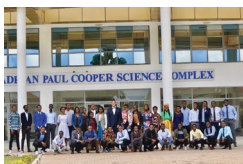
First Class of Medical Students on their Sabbath on Campus

The North New South Wales (NSW) Conference Health Ministries department launched the SoZo Health retreat as a model to assist people in lifestyle change. The retreat normally takes place in a hotel or spa with about 12-15 participants and 15-20 program volunteers. The SoZo Health Retreat goal is to bring restoration of body, mind, and spirit. It is a complete health approach shown to have long term results in just eight days. "We are fortunate to have other experienced professionals in our team working on our pilots as well as reviewing protocols, such as Bruce Thompson, a renowned physiotherapist in Australia and author of the website traditionalhydrotherapy.com now used worldwide as a reference guide for hydrotherapy treatments," reported Camila Ito Staf, NSW Conference Health Ministries director and SOZO Health coordinator. Local teams receive training and become ready to serve together running programs in their area every year. This is "an inclusive mission project that unites health professionals and lay people while enabling us to offer an opportunity for practical training for health professionals seeking to be involved in mission," shared Camila. The last SoZo retreat was held in February 2021, and now the retreats have become a fully sustainable ministry. This model will soon be launched by the GC Health Ministries department for use around the world under the name Enliven Wellness. Stay tuned!