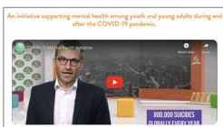
Covid-19 Mental Health Initiative