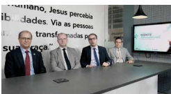
Presenters during the AMA Online Congress

António Guterres, the United Nations' (UN) Secretary-General, stated that the mental health of society has been severely impacted by the COVID-19 pandemic crisis and is a priority to be addressed urgently. He added that Mental health will remain a core concern even after the pandemic is over. In the US, the Centers for Disease Control (CDC) stated that 41% study participants reported at least one adverse mental or behavioral health condition during the pandemic. "The increase in depression, anxiety, stress and trauma-related disorders, substance abuse and suicidal ideations is staggering" especially among 18-24 year-olds, with three in four reporting at least one adverse mental or behavioral health condition, and one in four reporting seriously having considered suicide in the past 30 days. In response to this great need, the General Conference launched a Mental Health initiative during the church's Annual Council on October 8, 2021. The goal is to raise awareness, provide resources and call people to action to help reverse these statistics. Education, Family, Youth and Health Ministries came together with the goal of promoting the initiative and motivating people to become involved. More information is available in page 2 of this newsletter under resources.