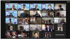
GC Health Ministries Virtual Advisory Attendees