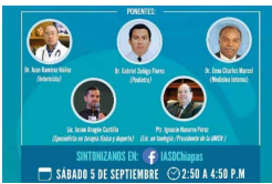
Panelists in the Chiapas Symposium