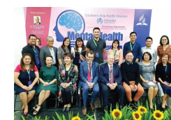
Participants of the SSD Mental Health Summit