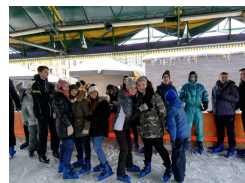
Youth attending the Youth Alive program in Serbia on ice.