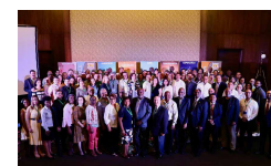
Attendees enjoying an inspiring conference in Punta Cana.

The Southern Asia-Pacific Division hosted its first ever Mental Health Summit. More than 400 delegates coming from the three Philippine unions participated in the summit on February 21-23, 2021. The Mental Health Summit investigated the inseparable relationship between the mind, the body, and the spirit, with the hallmark Adventist view of education: restoring the image of God in man. "The future is bright for the Adventist Mental Health Care system in the Philippines. This gathering of medical practitioners and Bible workers opens opportunities for integration to deliver effective ways and strategies that address numerous issues in mental health here in the Philippines," noted SSD health ministries director, Dr. Lalaine Alfano. Into the future, the organizers aim to host yearly mental health summits for the Division, and to establish more mental health care groups assigned to Adventist hospitals to assist in patients having signs of mental health issues. This leads to a bigger goal of having an Adventist facility dedicated to addressing mental disorders in the Philippines.