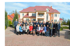
Conference participants at the Desna better living center in Ukraine.